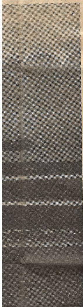
's End. Making for on the evening tide.