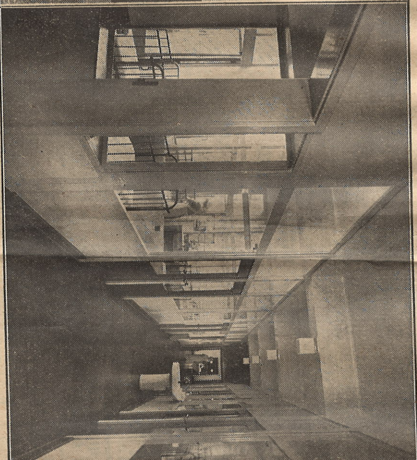
NEW EXTENSION to the Warrington General Hospital, to be opened next Thursday by the Duke and Duchess of Kent. On the left, the new block forming part of the extension; and, on the right, the children's ward.